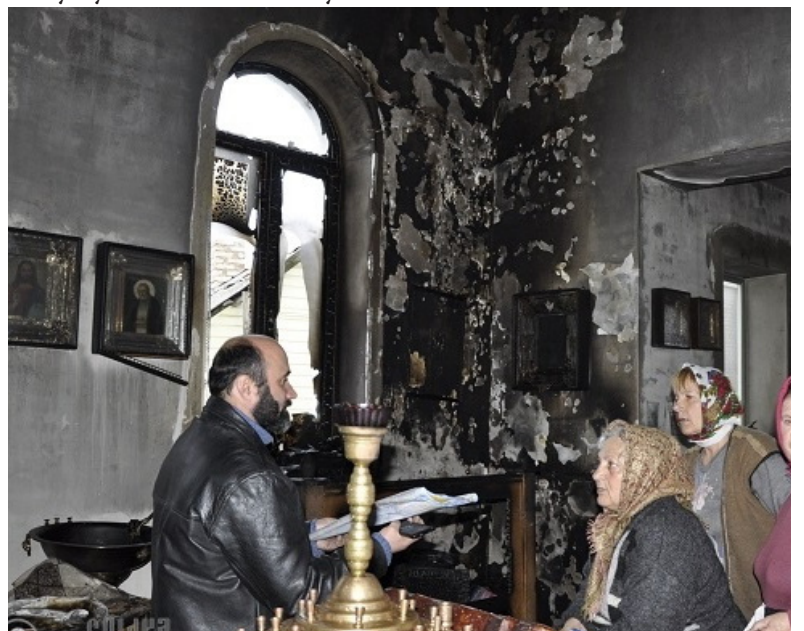
November 7 2016. Saints Cyril and Methodius church of the UOC arson.