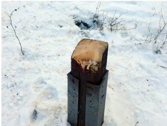
January 25, 2016. 34 year-old resident of Zhytomyr (Ukraine) dismantled the Orthodox worship wooden cross on the site of future temple construction.