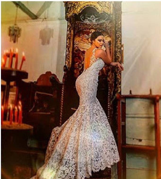
March 17, 2016. Sacrilege and an insult of religious feelings inside the historic Orthodox churches of Berati and Elbasan (Albania)