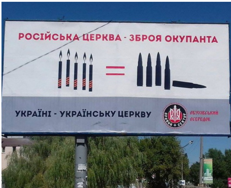
August 10, 2016. A provocative billboard displayed in Obuhov (Ukraine) directed against the Russian Orthodox Church