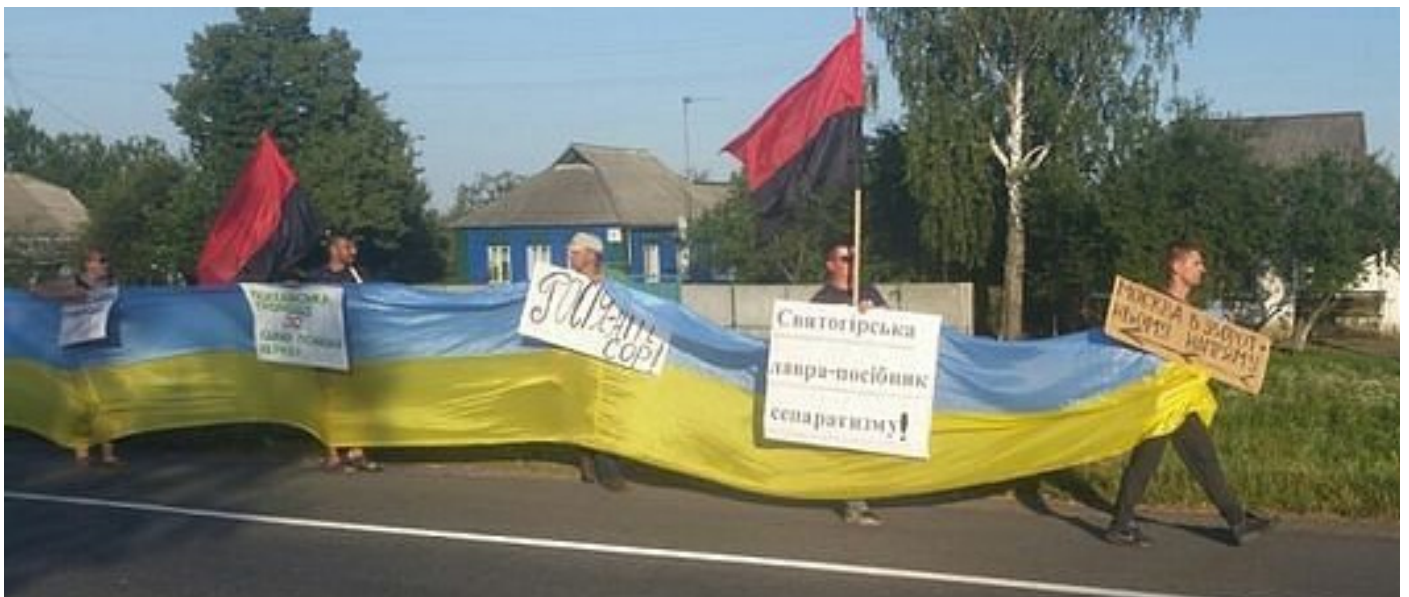
July 13, 2016 Ukrainian nationalists crying out rude insulting slogans and all sorts of slander, intimidating the faithful, during the all-Ukrainian orthodox cross procession