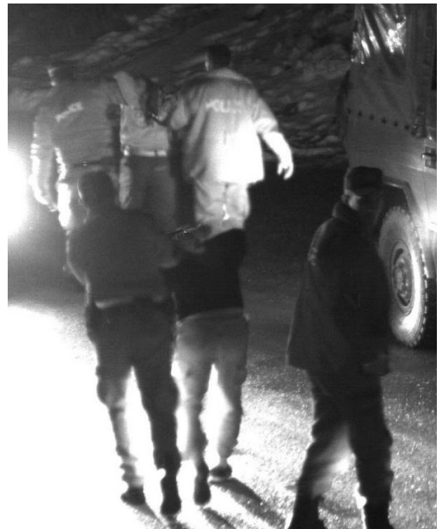
January 31, 2016. Four armed Islamists arrested in front of the main gate of Visoki Dečani Serbian Orthodox Monastery (Kosovo)