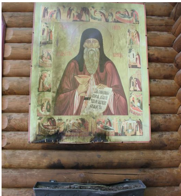
April 25, 2016. Attempt to set fire to a wooden Ukrainian Orthodox Church