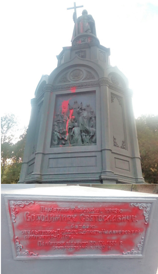
September 27, 2016. Monument to Holy Prince Vladimir the Baptist of Russia desecrated in Kiev.