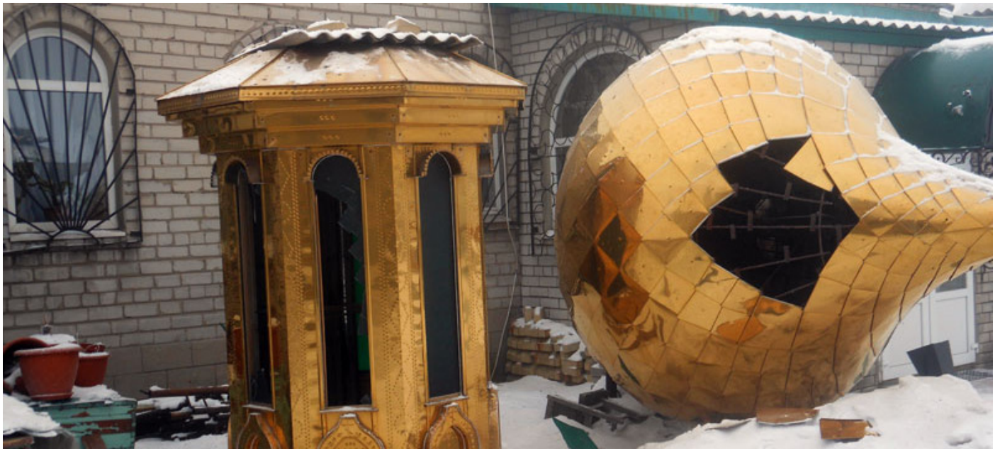
December 26, 2016. Alexander Nevsky Orthodox Sunday School destroyed and nearby church damaged during shelling of Debaltseve (Ukraine)