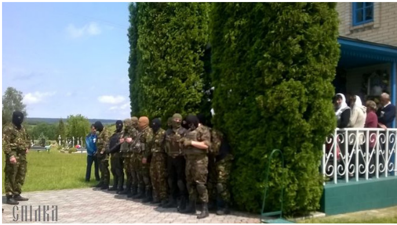
June 10, 2016. Men in camouflage and balaclavas seized UOC church in village Kolosovaya (Ukraine)