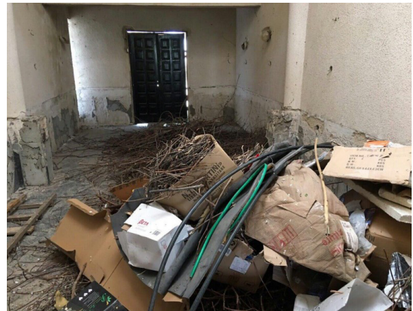
April 15, 2016. Kosovo police is not ready to adequately protect sites of Serbian Orthodox Church from frequent acts of desecration and disrespect, for instance the church of Christ the Savior in Priština was used as public toilet.