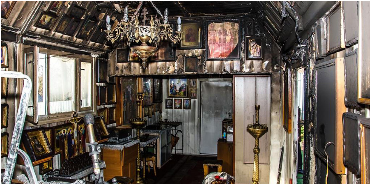
February 24, 2016. Arson in the temple of Mother of God in the city Mykolaiv, in Lviv region (Ukraine)