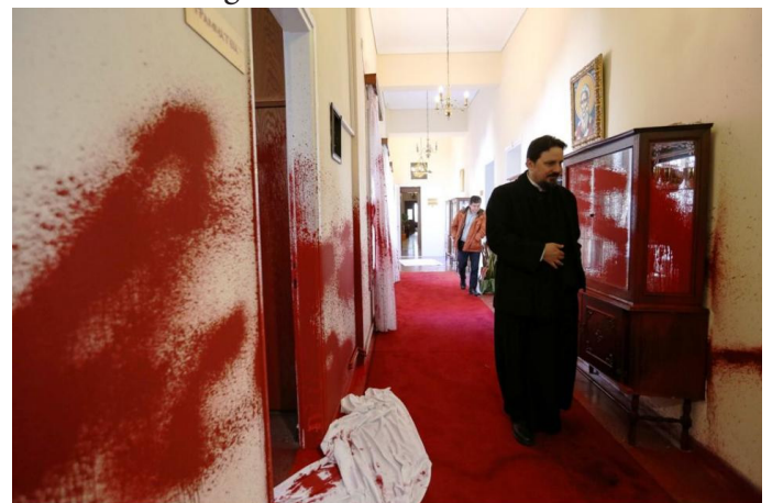
February 2, 2016. Anarchists sprayed the building of the diocese of Salonika (Greece); one man went to the hospital because they threw the colour in his face and his body.