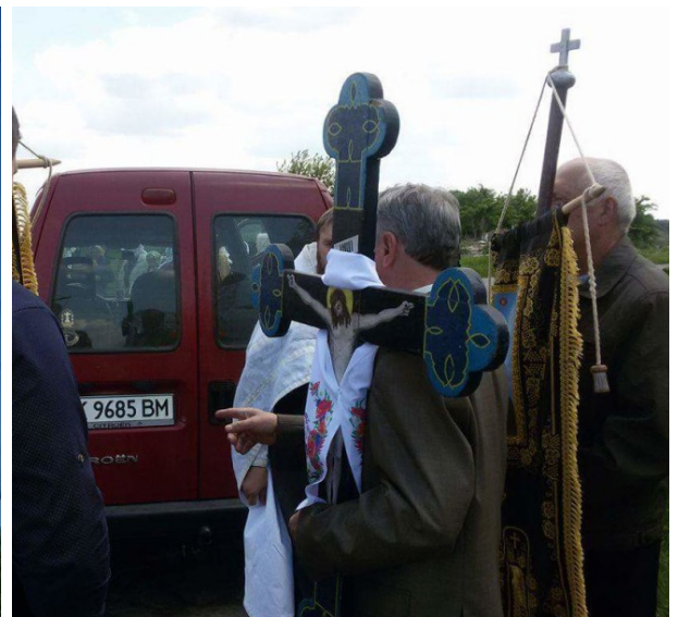
May 4, 2016. Priest and the believers of the Ukrainian Orthodox Church blocked at the enter the cemetery to perform a memorial service at the graves of deceased relatives