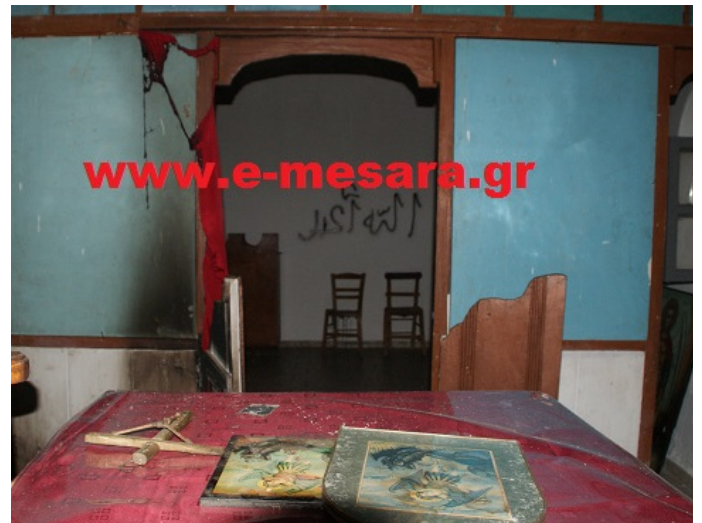
December 18, 2016. Vandals set fire on a Greek Orthodox church in the Lagolio village of Crete and wrote "Allah is great".