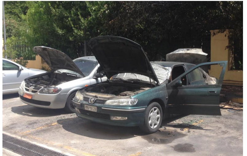
August 8, 2016. The central office of the Church of Greece's Holy Synod was struck by arsonists,