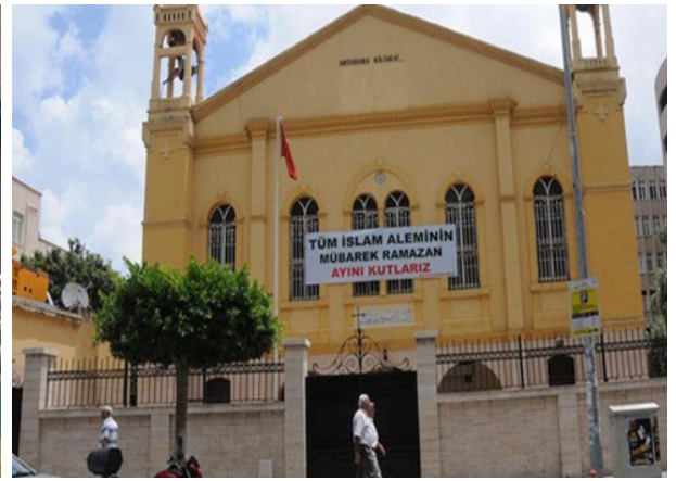
June 6, 2016. Turks hang pro-Islamic Ramadan banner on Greek Orthodox Church